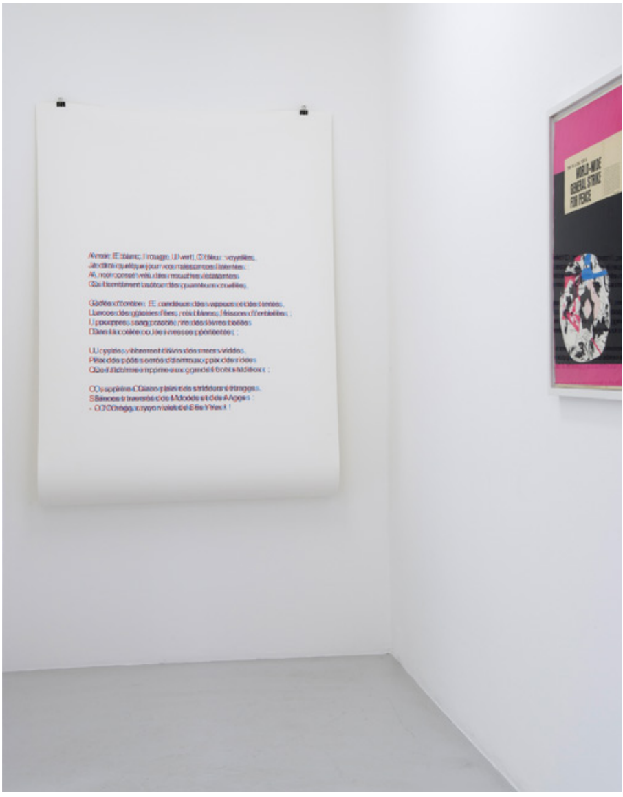
Exhibition views of "Arthur Rainbow", Air de Paris, Paris 2012.

Giancarlo Politi Editore - via Carlo Farini, 68 - 20159 Milano - P.IVA 09429200158 - Tel. 02.6887341 - Fax 02.66801290