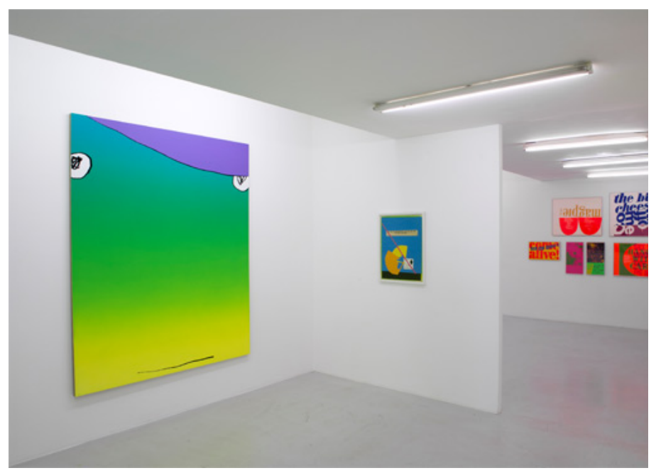
Exhibition views of "Arthur Rainbow", Air de Paris, Paris 2012.

poem Les Voyelles . Rob Pruitt's schematized and gaudy portraits are colorfield paintings clumsily done eyes and mouths as awkward and jarring Smileys verging on the sickly: "something that makes you feel slightly uncomfortable."