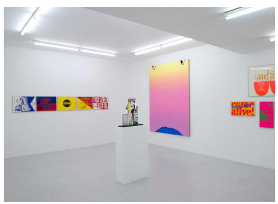
Exhibition views of "Arthur Rainbow", Air de Paris, Paris 2012.