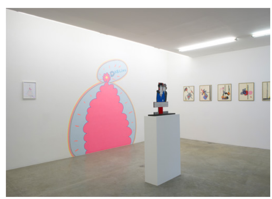
Exhibition views of "Arthur Rainbow", Air de Paris, Paris 2012.

Highjacking the name of the iconic French poet, the Arthur Rainbow group show at Air Paris is a display of works whose common feature is the liberating, transformative and ecstatic power of color. The playfulness and the cheerful colors of the works exhibited I as much embellishment as a less edifying reality (the impossibility of eternal youth, the for human liberty and pleasure, the unbearable lightness of being, etc.).